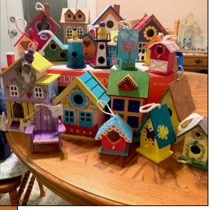
What's next for the birdhouses? We may auction them off at a future meeting, with proceeds going towards scholarships.