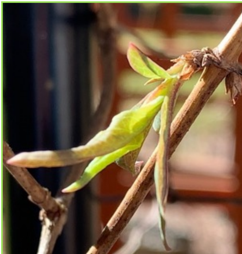
Can you spot the faerie in the garden? Photographer Judy Fruhbauer says she expects she caught him napping after a little too much dancing around the Maypole.