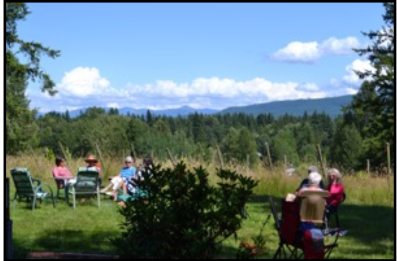
AAUW members and guests enjoy the sun at Vartanyan Winery.