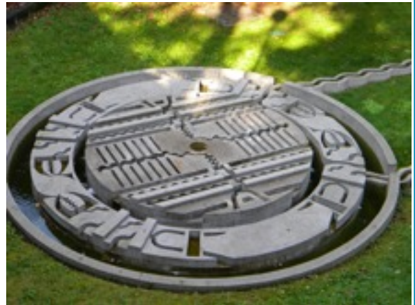
Unmoved fountain: "The Islands of the Rose Apple Tree...." Alice Aycock, 1987.

campus. This means many carefully-sited pieces no longer have the amount of open space around them that they once had. This has led to a decision to place new acquisitions indoors. One such placement is Do Ho Suh's "Cause & Effect." Americans for the Arts has recognized this acrylic pendant as one of the top 50 public art projects in the United States in 2012.