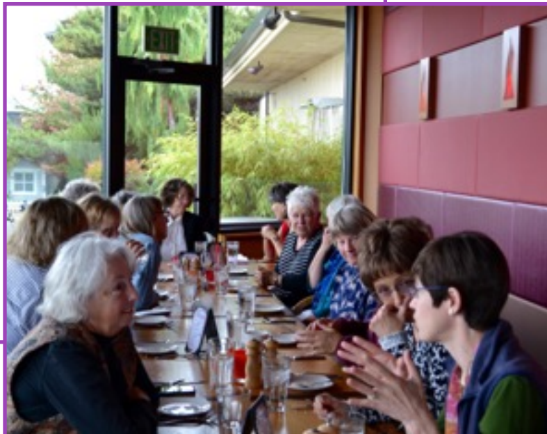
Members chat at last year's luncheon.