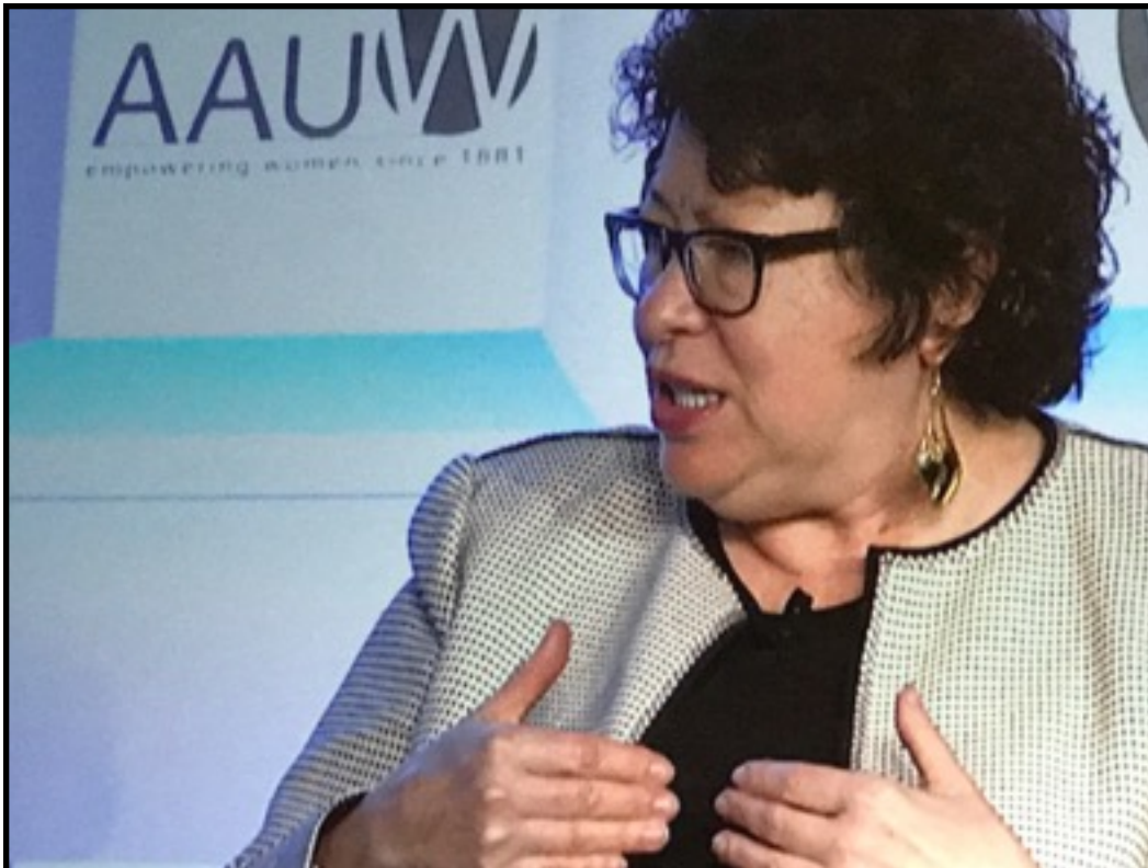
United States Supreme Court Justice Sonia Sotomayor