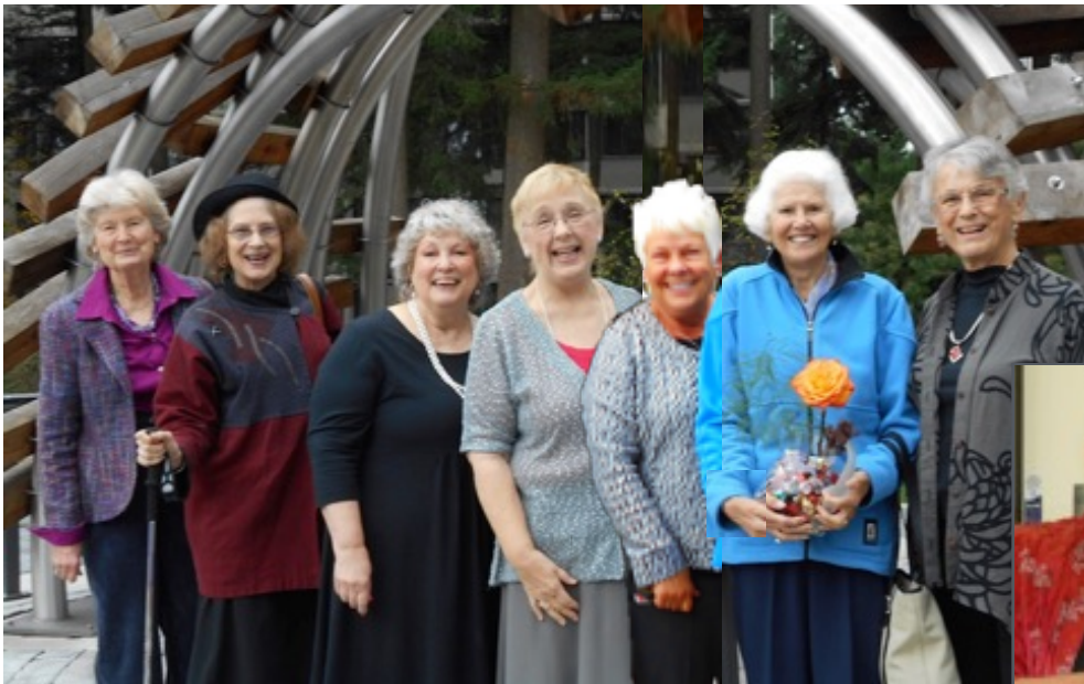
Celebrating with CFUW