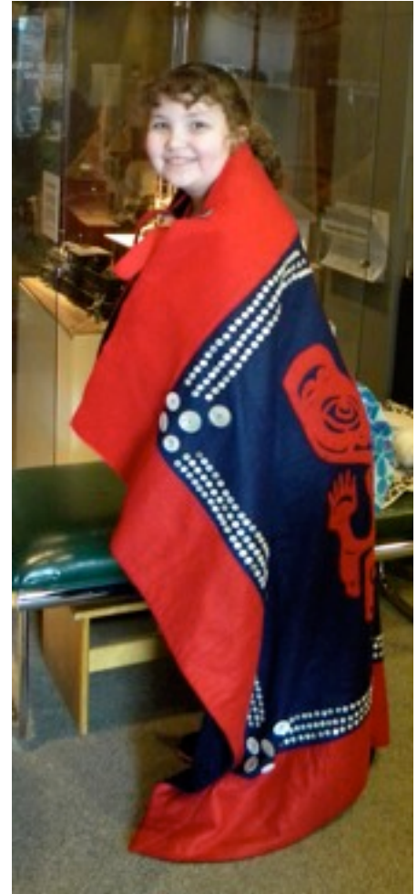
Geneva Elementary student Jenny Cherry models a traditional button blanket from Whatcom Museum collection.

Teachers are grateful for the chance to give the students a hands-on lesson that would be impossible to carry out at school. The kids were very interested and focused on what they were learning.