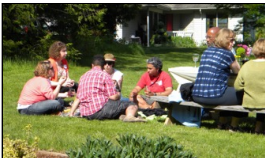
From the photo album: In both photos on this page, guests enjoy the wine and the view at our 2012 wine-tasting at Vartanyan Estate Winery. Join us for a repeat on June 20, 2 to 5 p.m.